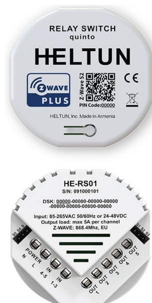
Figure 3: SmartStart QR Code & DSK